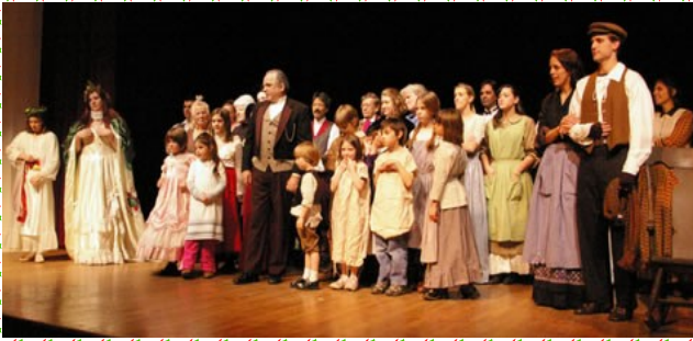
The cast of A Christmas Carol

Congratulations Julie on your triumphant return with your wonderful adaptation!